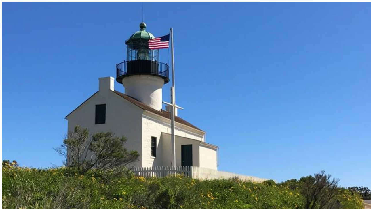
Cabrillo National Monument, San Diego, California.

Field studies are limited to the children enrolled in the respective course and a parent(s) or other designee who is an immediate relative. Siblings who are not also enrolled in the class are not eligible to attend the field study. Exceptions may be granted by a teacher with administrative approval.