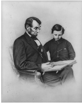
President Lincoln reading to his son, Tad.

Achievement Tests Daily Schedule Outside-Classroom Activities Field Studies Goals/Lesson Plans Grades Grading Scale Homework Policy Honor Roll Notebook Method Parent/Teacher Conferences Report Cards Retention