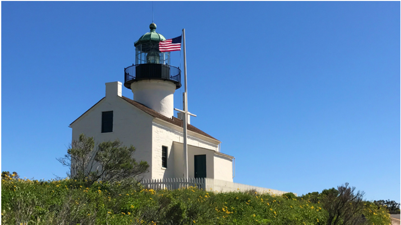
Cabrillo National Monument, San Diego, California.

Field studies are limited to the children enrolled in the respective course and a parent(s) or other designee who is an immediate relative. Siblings who are not also enrolled in the class are not eligible to attend the field study. Exceptions may be granted by a teacher with administrative approval.